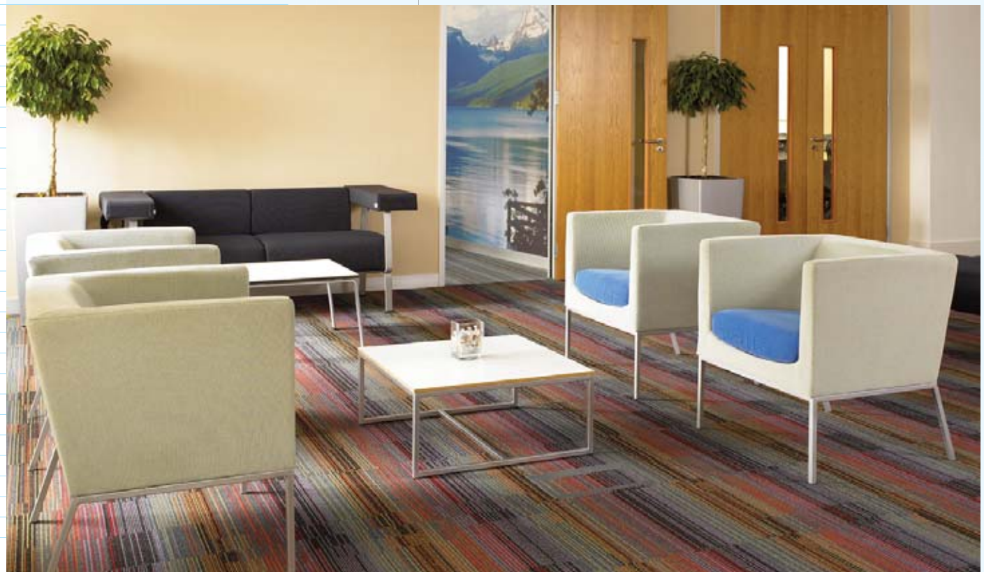
Nokia Music - Bristol