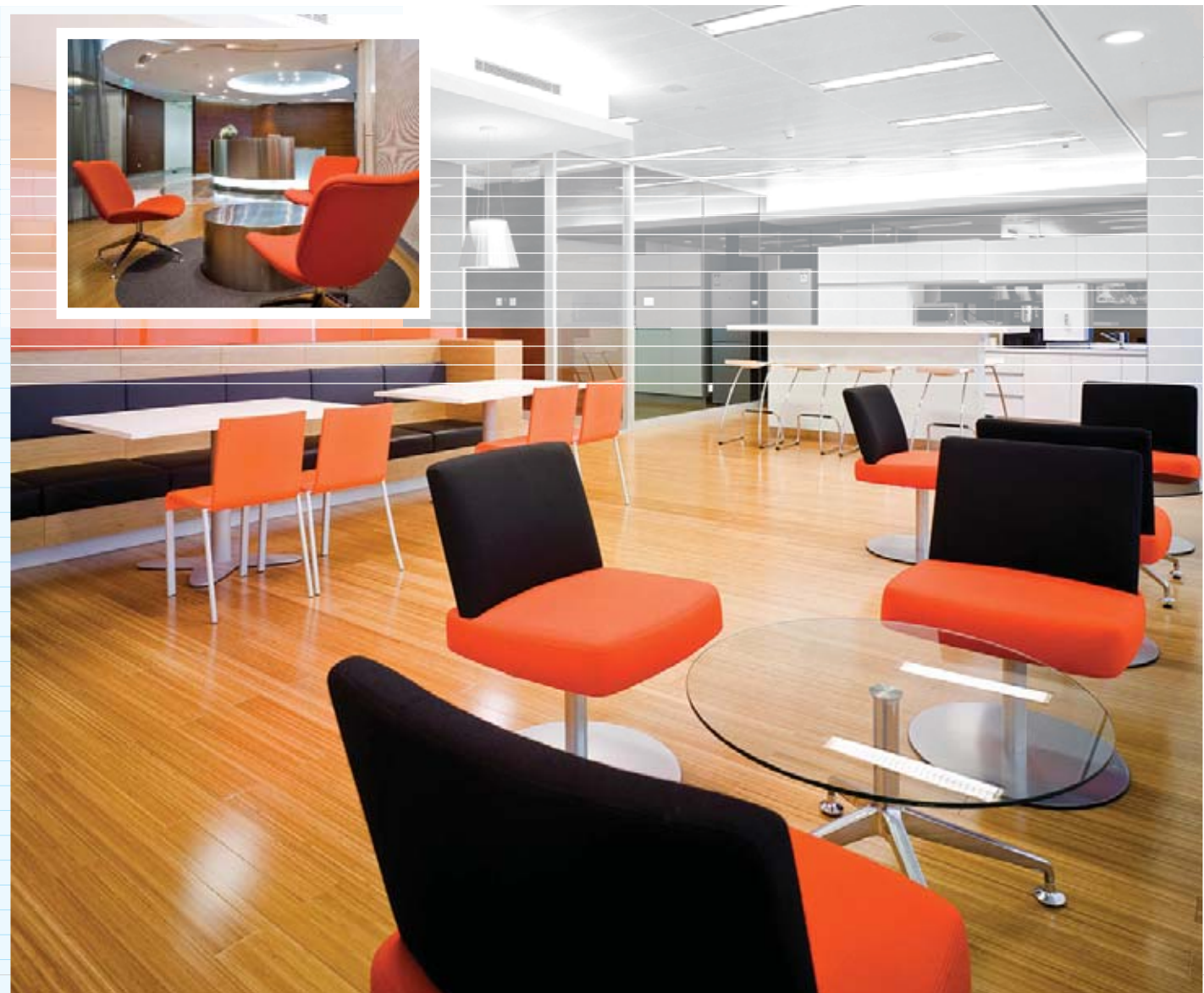
Wallmart in Beijing